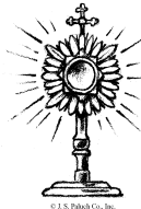
Adoración del Santísimo Sacramento

Aun necesitamos más voluntarios para cubrir cada hora, también necesitamos más personas que se detengan a visitar a Jesús durante el tiempo de Adoración. Le animamos a que lleguen unos minutos antes para firmar el libro de Adoración, se encuentra en la entrada de la Capilla.